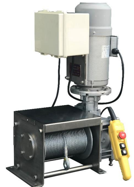
G&W 3500 WINCH (THIS MODEL IS CONSTRUCTED IN 316 STAINLESS STEEL)

Email: admin@winch.com.au Website: www.winch.com.au