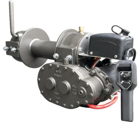
Above image is our MAG12 (12,000LB Electric Winch)